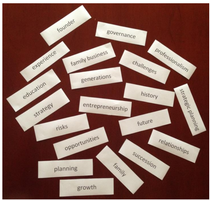
Figure 3: Words used in the focus group

encompasses four analytical categories: a) relevance of the founder; b) challenges; c) governance; and d) heirs represented by several words. Two researchers, who are expert practitioners in the field, helped to adapt the discourse script for the context of the family business. We used these categories because they describe the entrepreneurship adopted by family businesses and considering the role of families. Thus, keywords were written on flashcards based on the study objective and the literature. These flashcards were submitted to critical appreciation by a research group. This research group consisted of a group of academics and practitioners with different perspectives, such as entrepreneurship, family business, international business, strategic management and networks. In a specific way, the flashcards bore words related to entrepreneurship, family businesses and generations, such as founder, governance, succession, growth, family and experience (Figure 3).