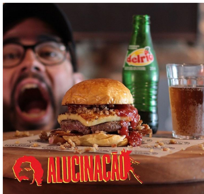
Fig. 03 Hallucination - hamburger in honor of Sobral

However, the success of the house did not come to nothing, due to the competition, Brick's needed to change its marketing strategy, starting to work with value generation through experience. So, customers go to the burger shop not to eat a burger, but to eat a Brick's. And the passion of customers for Brick's is so great, that the house also sells bags and blouses with its brand printed. All decorated in a retro style, at Brick's you can find posters of bands and characters from the 80s and 90s, such as: Jaspion, Chapolin, your Madruga, Hommer Simpson and even artists and iconic bands like Nirvana, Amy Winehouse, Bob Marley, Michael Jackson, Queen, The Beatles, The Rolling Stones, among others (Figure 2). In addition to these, which he could not miss, Albert Einstein, because the theory that launched him to stardom, the theory of relativity, was proven four years after its emergence, thanks to an experiment carried out simultaneously in Sobral, Brick's city and on the island of Príncipe, in Africa. So Brick's couldn't help but reference this historical fact.