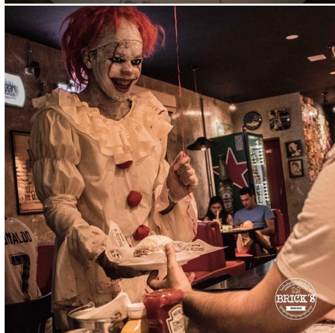
Fig. 07 Dessert "A Thing"

The differentiated service, the environment with every detail designed to provide the Brick's experience, with songs that identify the place and entitled to a play list on Spotify, in addition to its own flavor, full of regionalism and without losing the characteristics of a "true hamburger", Make Brick's something desired by customers in Sobral, neighboring cities