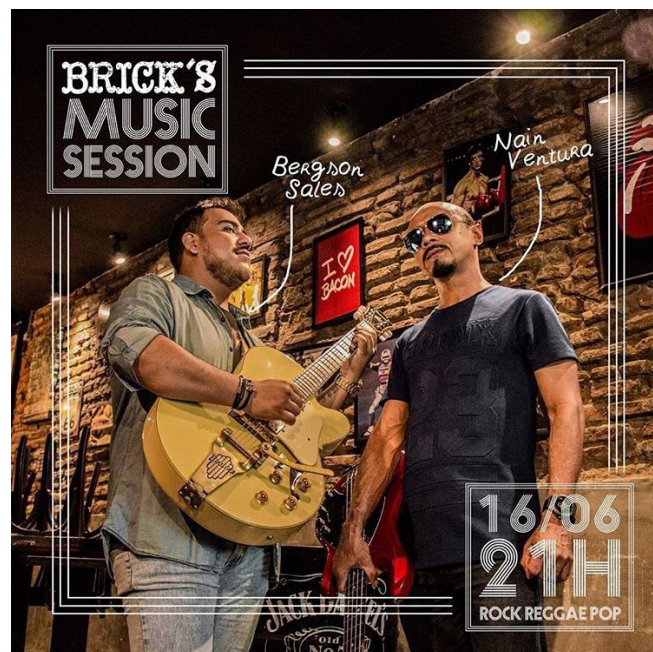
Fig. 04 Brick's Music Session Announcement

a special city and being from Sobral is a pride. So the owners of Brick's paid homage to the Princess of the North (as the city is called), with what is most peculiar about it, creating a genuinely hamburger Sobralense. The name of the hamburger, Hallucination, was given in honor of Belchior, an artist from Sobral, and all the ingredients that make up the sandwich are also from Sobral, such as: crispy crackling flour made in the traditional Bar do Dermeval (one of the oldest bars in the city), baked coalho cheese produced by Lassa (dairy factory in Sobral, founded in 1969), crispy bacon caramelized with Guaraná Delrio (soft drink factory also in Sobral), special vinaigrette from Bar do Lulu (another traditional bar in the city), bread from Pão Mix (bakery also Sobralense and Brick's partner), handmade ketchup from Brick's and to drink a super cold Delrio. As expected, the sandwich was successful in the city and among customers.