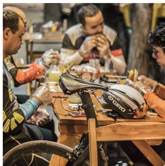
Fig. 05 Pedal boats coming from Fortaleza to eat a Brick's