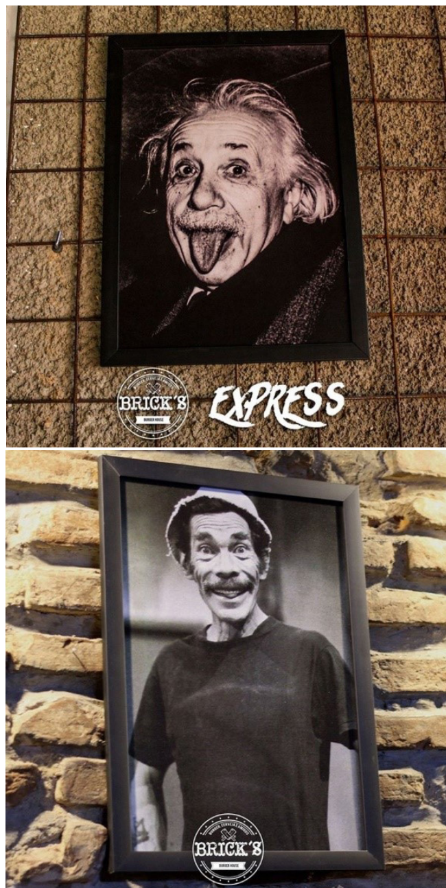
Fig. 02 Character posters