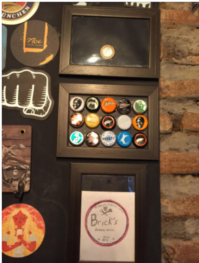
Fig. 01 Lucky coin