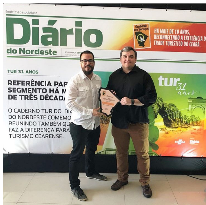
Fig. 06 Brick's members receive awards

Brick's success is such that at the end of 2017 the partners received, in its second year of operation and for the second consecutive year, the Sebrae 2017 Quality Seal (Figure 6). The award is the result of a joint action by Sebrae/CE and the trade state tourism, aiming to encourage the implementation of improvements in products and services offered in companies in the field of accommodation, food and events, working as an instrument to recognize the efforts of entrepreneurs who are providers of excellent and quality services in the tourism market. To achieve certification, companies go through an evaluation process, which involves the analysis of more than 200 items, such as the state of the physical facilities of the establishments, compliance with safety rules, storage and handling of food, the correct destination waste and good service practices, among other requirements.